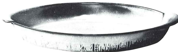
7Q-13" DEEP PLATTER 8.00