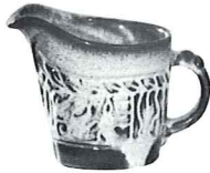
7A-6 OZ. CREAMER 3.50