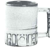
*C4-12 OZ. COFFEE MUG 3.50