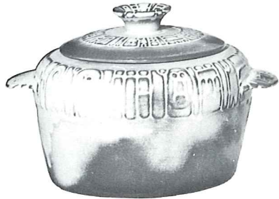
7W-3 QT. BAKER/BEAN POT 14.50 7W/W-BAKER & WARMER, SET 22.00