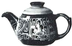
7J-2 CUP TEAPOT 7.00