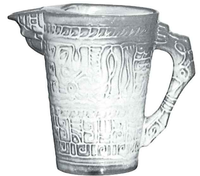
7D-2 QT. PITCHER 10.00