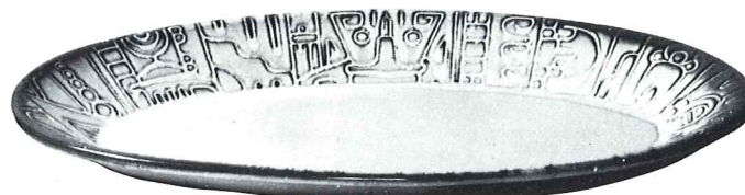
7TP-17" AZTEC OVAL PLATTER 17.50