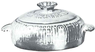
7V-2 QT. BAKER/BEAN POT 10.00 7V/W-BAKER & WARMER, SET 17.50