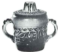
7B-SUGAR WITH LID 5.50