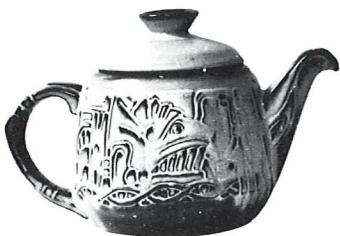
7T-6 CUP TEAPOT 10.00