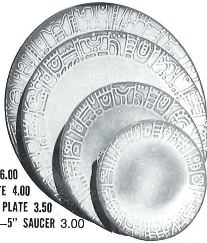
7FL-10" PLATE 6.00 7F-9" PLATE 4.00 7G-7" PLATE 3.50 7E-5" SAUCER 3.00