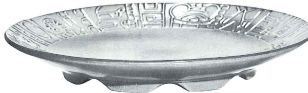
7FC-15" CHOP PLATE 25.00