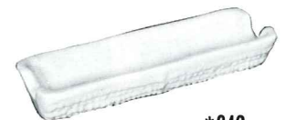
*242 CORN DISH 3.00

This page available in colors shown on opposite page - except where noted * Available in Standard Frankoma Colors PLUS Peach - ADD 50% for Flame