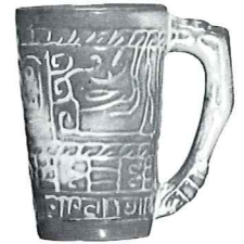
7M-14 OZ. MUG 5.00